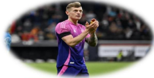
May 2024 _ Santiago Bernabeu Stadium

با توجه به متن داده شده، جدول زیر را کامل کنید.